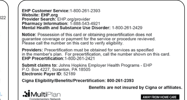
*ID cards vary from one employer group to another.